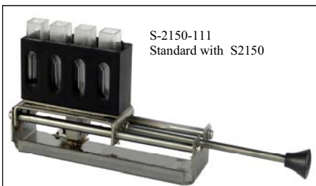
S-2150-111 Standard with S2150