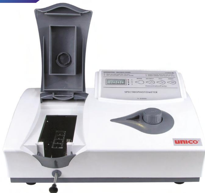
S1200's 50mm pathlength sample chamber accepts a wide variety of cells and accessories