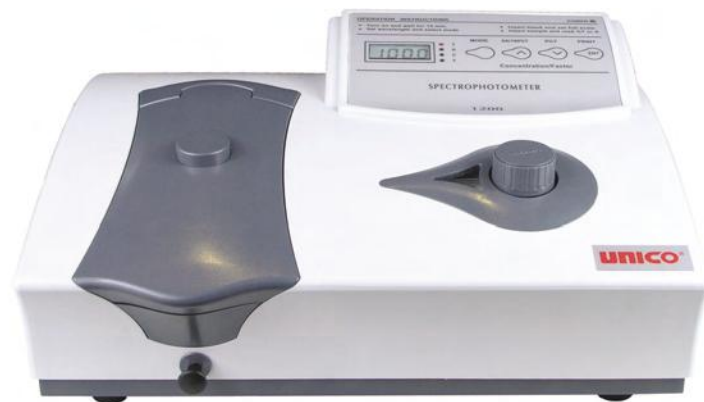
S1200 shown with Cuvet Holder closed